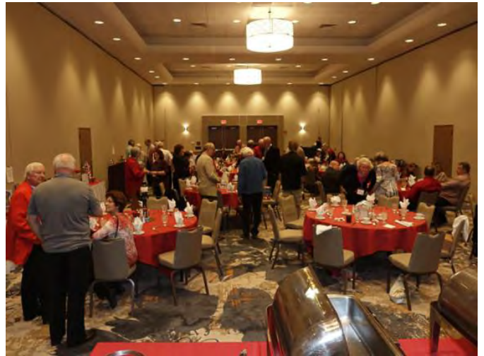
A view of some of the early arrivals from the back of the food buffet line