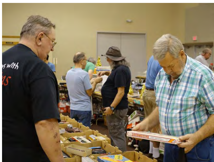
It's not S gauge so I'm selling it real cheap...