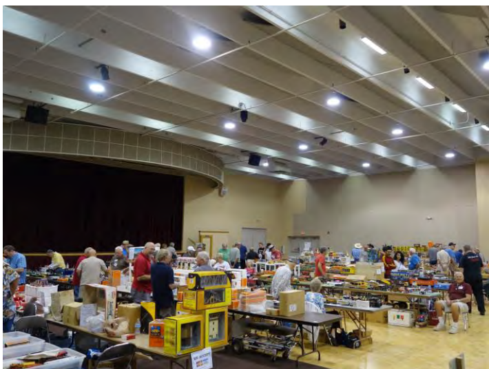
During a slow part of morning we got away from our admissions desk and took a couple of quick pictures