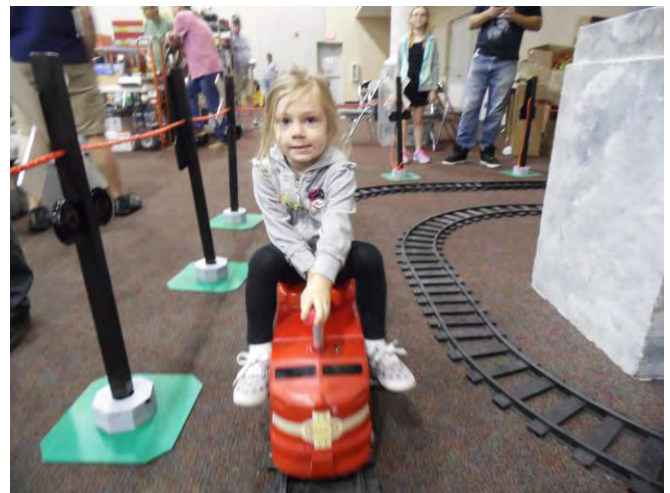
Hard to decide which of the smiling faces to use. We have numerous pictures of the kids having fun riding the train at the show and many waited patiently for their turn.