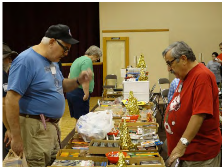
Hard to tell if this is a stalemate or a sale